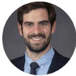
Ignace Beguin Billecouq Ocean and Coastal Zones Lead, UN High Level Climate Champions