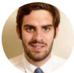
Ignace Beguin Billecocq Ocean & Coastal Zones Lead, UN High Level Climate Champions Team