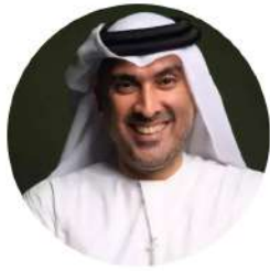
Yousuf Lootah Acting CEO of Corporate Strategy & Performance Sector, Dubai's Department of Economy and Tourism