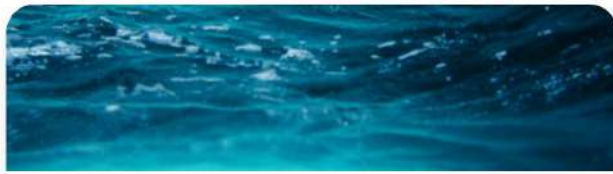
Young professionals for our oceans: Deep Dive outcomes and recommendations