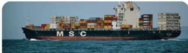
Sustainable Maritime Decarbonisation for Healthy Oceans