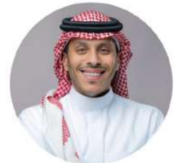
H.H. Prince Sultan bin Fahd Al Saud