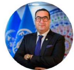
Ahmed Mukhtar Representative of Food and Agriculture Organization of the United Nations to United Arab Emirates